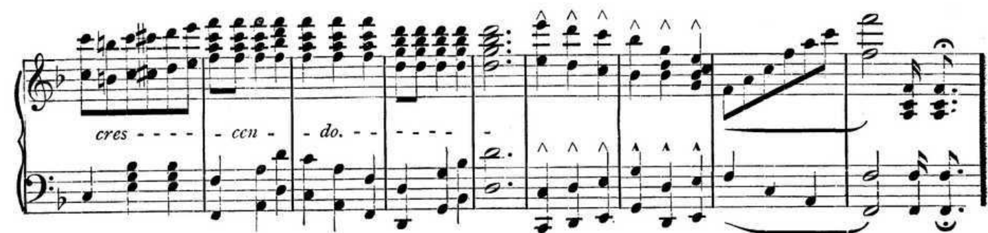
Air Ship Waltz-5.