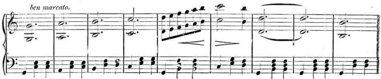
Air Ship Waltz-2.