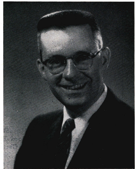
Assistant Law Dean Named