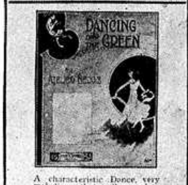
A characteristic Dance, very melodious, that will appeal to all lovers of light, catchy melodies. By ATELIER BEDOIS