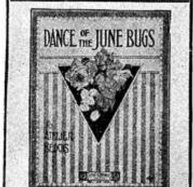
A bright, melodious, characteristic instrumental number of decided beauty. By ATELIER BEDOIS