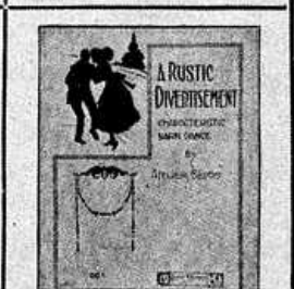
Characteristic Barn Dance by ATELIER BEDOIS

These Numbers Are Exceptionally Melodious and Highly Recommended for Teaching Purposes.