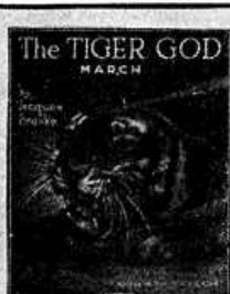
A stirring 4/4 March, filled to the brim with inspiring melodies. By JACQUES BRUSKE