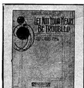
Semi Sacred Song by CARO ROMA