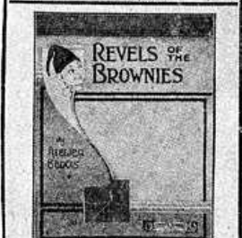
A charming, lilted Dance number, written in the composer's happiest style. By ATELIER BEDOIS