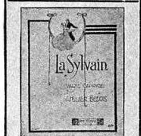
A beautiful Palse Caprice by ATELIER BEDOIS