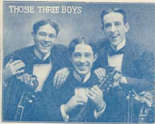
THOSE THREE BOYS

PUBLISHED BY HOWARD & BROWNE MUSIC CO. ST. LOUIS, MO.