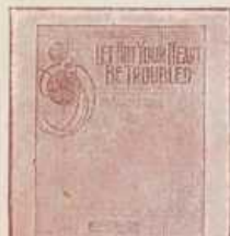
A beautiful song by CARO ROMA