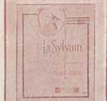
A beautiful Piano Solo by ATTILIO BEDONI