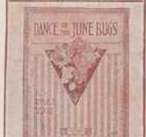
A beautiful, infectious, charming instrumental melody of Attilio Bedoni