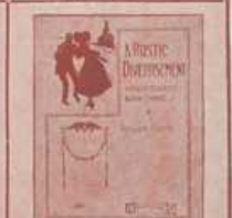
Charming Best Duett by ATTILIO BEDONI