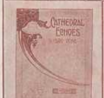
A beautiful "Chorus" melody by CARO ROMA

A collection of melodious Song and Instrumental numbers by famous composers. In this edition will be found compositions worthy of a place in the highest grade catalogues of the entire music world. Both songs and instrumental pieces will be a welcome addition to the repertoire of every music lover in the land. They are issued in an especially attractive manner, printed upon the best grade of paper and adorned with artistic frontis-pages.