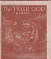
A warm, 12-Measure, 12-Step Tune with suggestive melody. By JACQUES BROUSSE