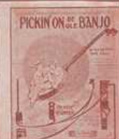
A rhythmic, 12-Measure, 12-Step Tune with suggestive melody. By FREDRIC WATSON and HENRY WOMACK

These Numbers Are Exceptionally Melodious and Highly Recommended for Teaching Purposes.