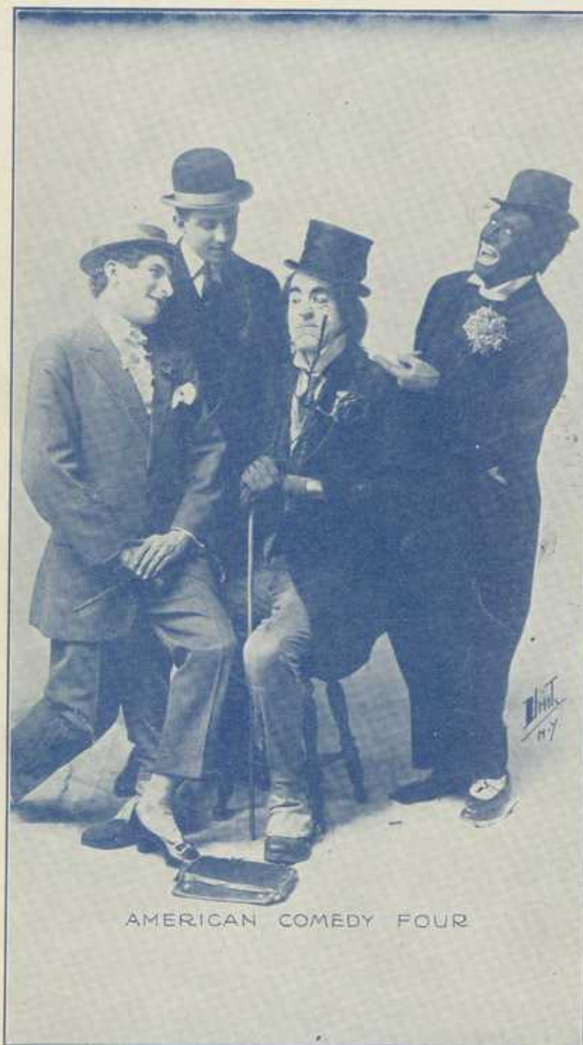
AMERICAN COMEDY FOUR