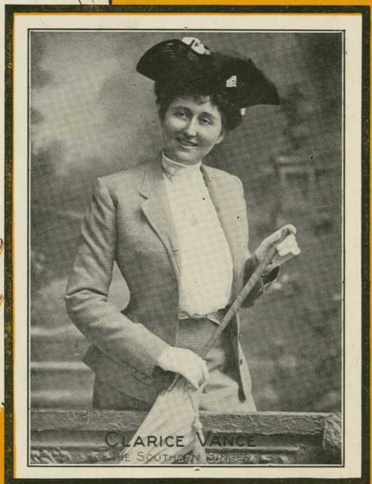
CLARICE VANCE THE SOUTHERN SINGER