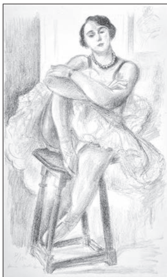
Henri Matisse (French, 1869–1954). Dancer on a Stool (Danseuse au tabouret) from Ten Dancers (Dix Danseuses) , 1927. Lithograph on paper. IU Art Museum 72.55