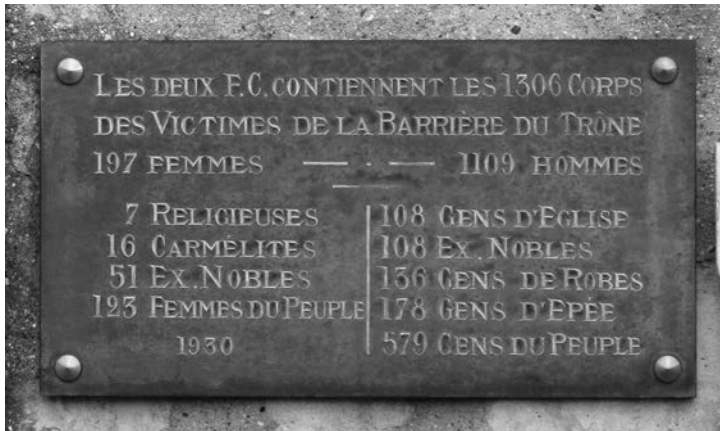
Plaque at the entrance to the field of common graves at Picpus Cemetery.

My inspiration for the production comes from the source. Long ago, I made a solemn visit to the Picpus Cemetery on Rue de Picpus in Paris, where the 16 Carmelite nuns, our protagonists, were interred in an open grave after their atrocious beheadings at the Place de la Nation in 1794. Parisians witnessed one of the worst excesses of Robespierre's Reign of Terror during this time that followed the French Revolution. The sisters' only "crime" was holding fast to their religious beliefs. Their memorial is located in the back of the cemetery, ironically near the grave of the American General Lafayette who fought in both the French and American Revolutions. His gravesite is dirt from the Battle of Bunker Hill, and it is actually American land; interestingly, our flag flew on the site all during World War II. Horrifically, we all know this kind of genocide still happens. One can hope this offering of art helps people reflect on our world today.