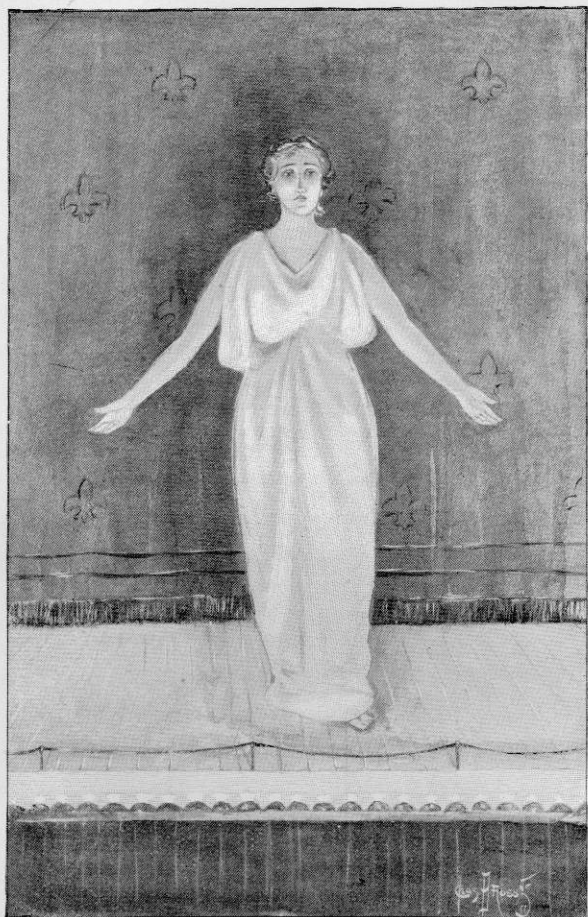
LIKE A GREEK GIRL