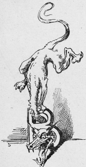
plate with the raisins. And Harry saw that each successive flame was the fold in the long body of a bright

UT when he opened them again, what a sight he saw! All over the room the blue flames leaped and danced as they had leaped and danced in the soup-