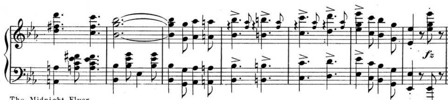
The Midnight Flyer.