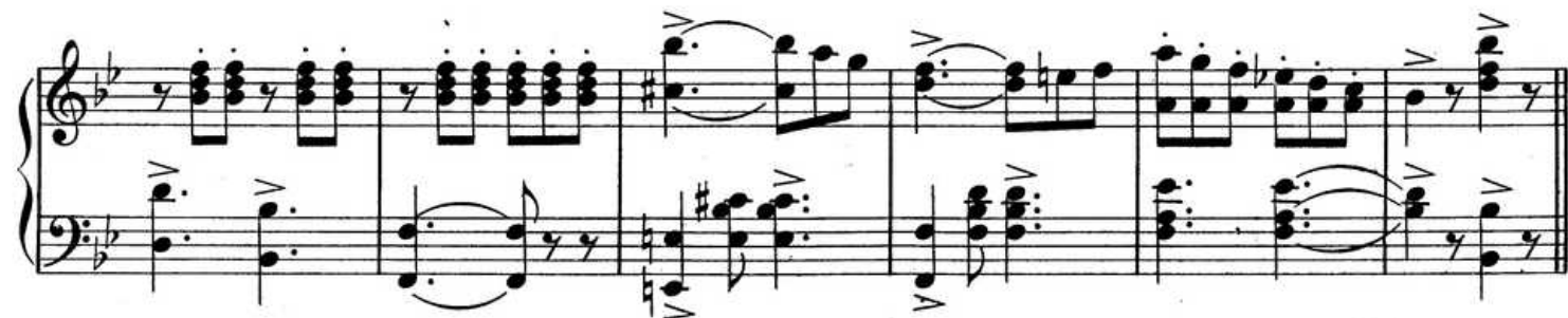
The Midnight Flyer.