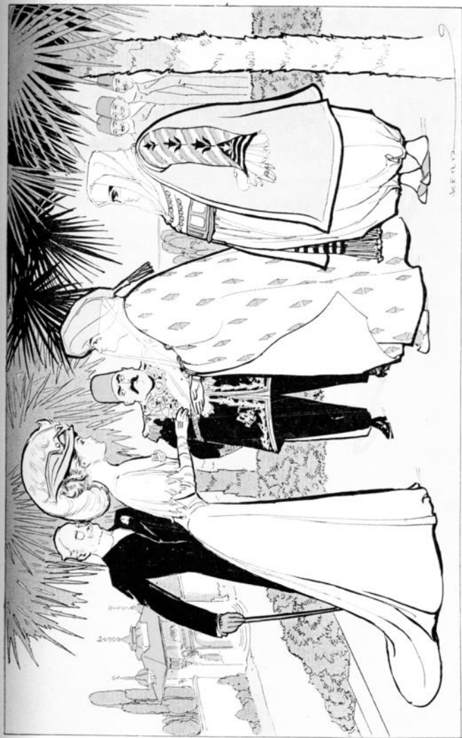
Being presented to the Consul's wife