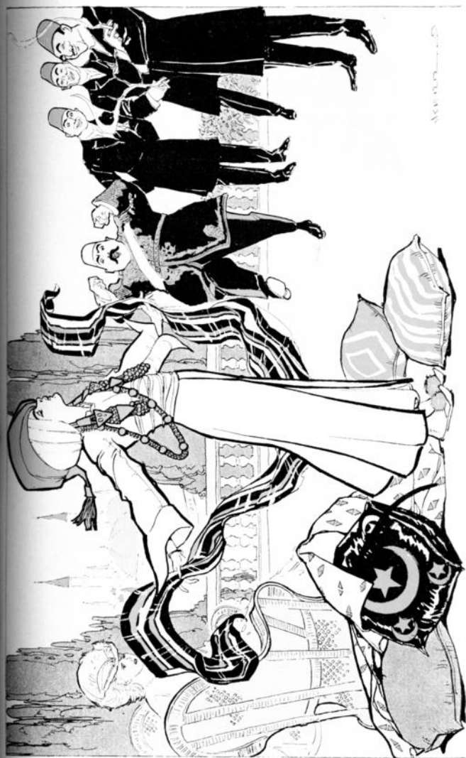
She threw off the quilted robes