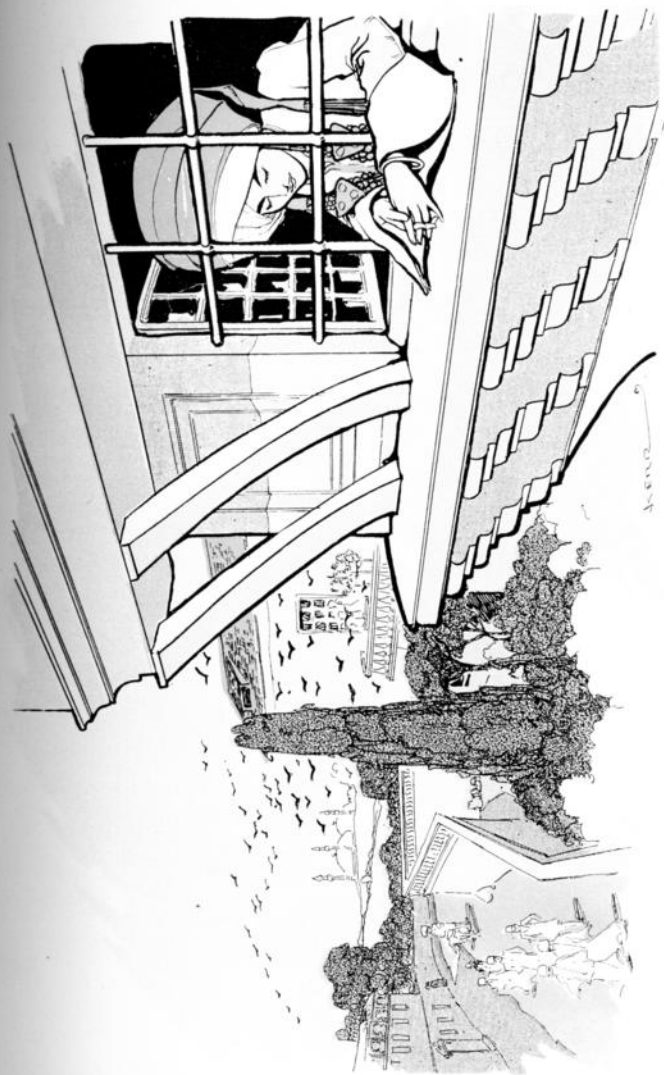
Kalora sat by the cross-barred window and envied the humble citizens