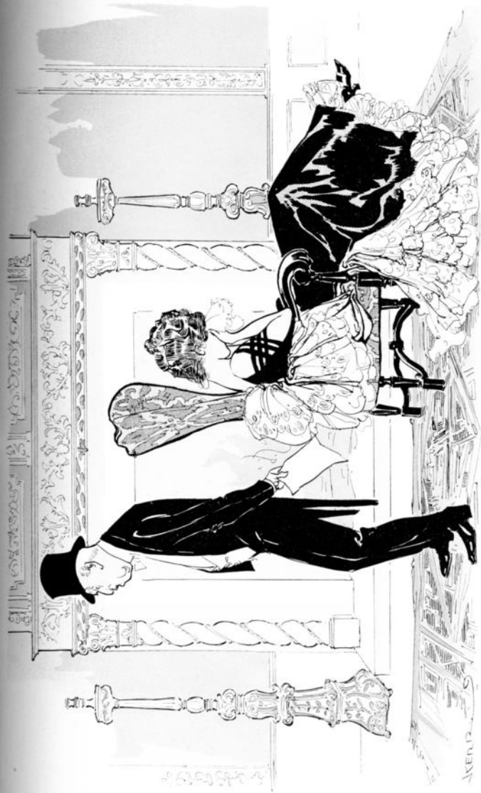
They were to come home with all speed