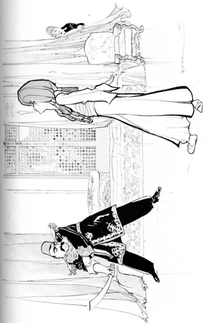
Her father coaxed