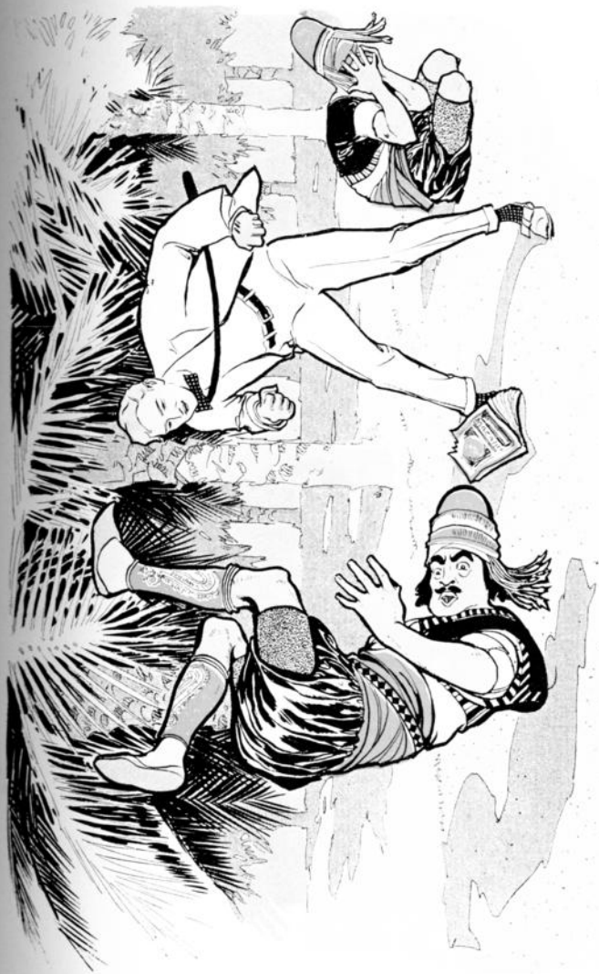
A sound as when the air-brake is disconnected