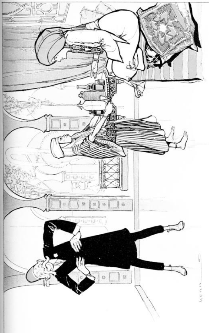
Papova rejoiced greatly