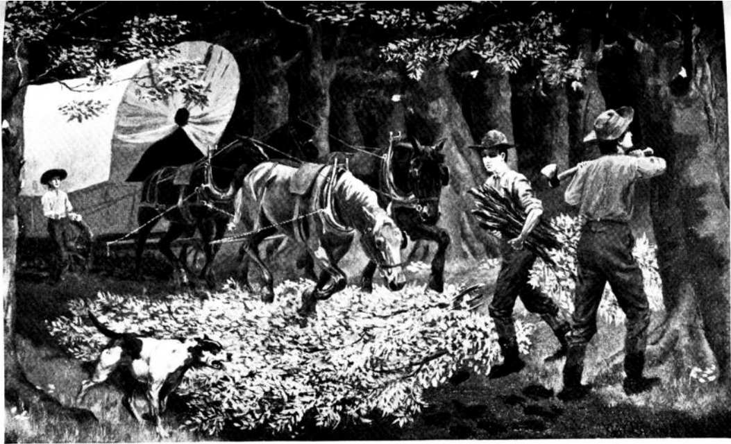
The two hurriedly cut a large number of branches from the trees and spread them in the road. — Page 29.