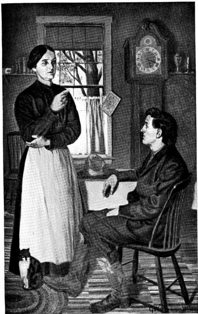
"I ain't no gossip, Jack." — Page 193.