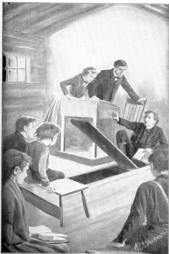
HANK BANTA'S IMPROVED PLUNGE BATH