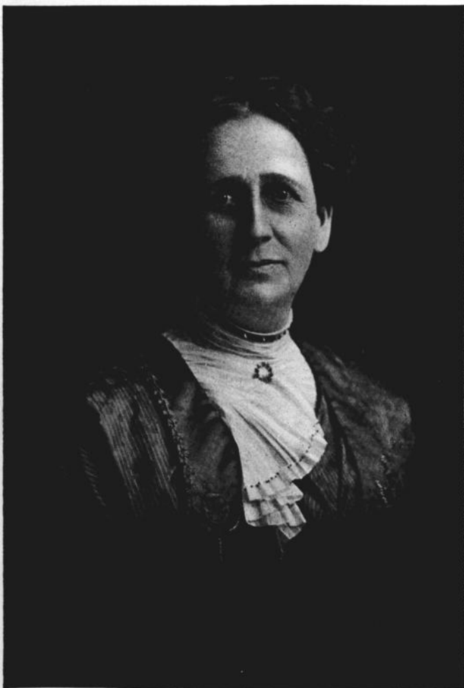
Rose Hartwick Thorpe