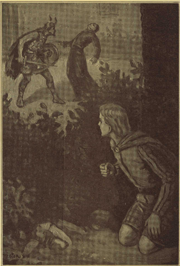
"FERDIAD'S EYES GREW WIDE WITH HORROR"