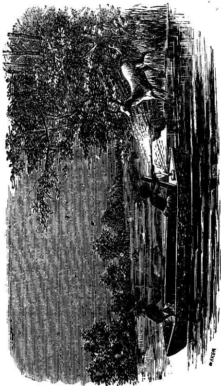
INDIANS FIRE-HUNTING ON THE SALIMONIE.