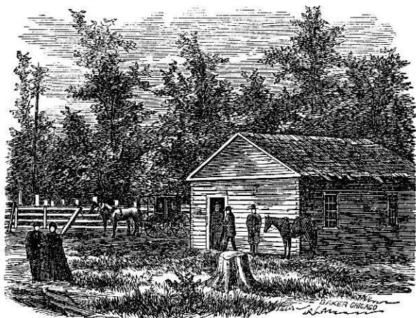
THE LIMBERLOST CHURCH.

Though forsaken the rustic church is not forgotten.