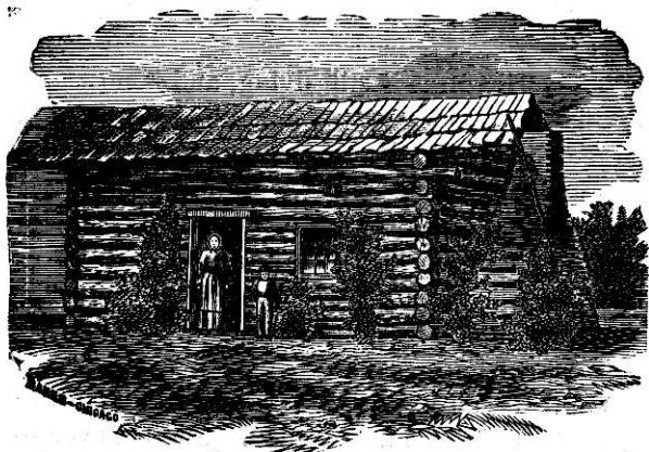
THE HAWKINS CABIN—SEE MAP.

"Best of all, there was in our parlor that household altar, the blazing wood-fire, whose wholesome, hearty crackle is the truest household inspiration. I quite agree with one celebrated American author, who holds that an open fire-place is an altar of patriotism. Would our Revolutionary fathers have gone bare-footed and bleeding over snows to defend air-tight stoves and cooking-ranges? I trow not. It was the memory of the great, open kitchen fire, with its back-log and fore-stick of cord-wood—its roaring, hilarious voice of invitation—its dancing tongue of flame, that called to them through the snows of that dreadful winter to keep up their courage, that made their hearts warm and bright with a thousand reflected memories."