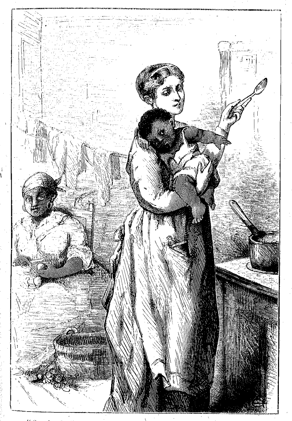
"One hand stirred gruel for sick America, and the other hugged baby Africa." -P_{AGE} 76.

I waited for New Year's day with more eagerness than I had ever known before; and, though it brought me no gift, I felt rich in the act of justice so tardily performed toward some of those about me. As the bells rung midnight, I electrified my room-mate by dancing out of bed, throwing up the window, and flapping my handkerchief, with a feeble cheer, in answer to the shout of a group of colored men in the street