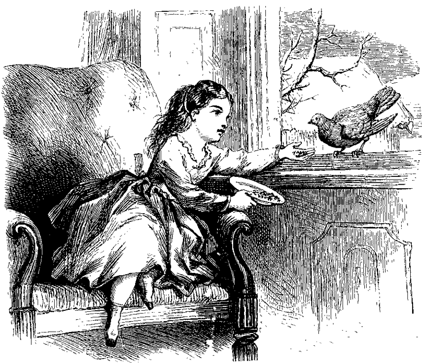
Alice and the Pigeon.

but she couldn't tell whether or not it was the white and brown pigeon she had sheltered and fed in the morning. But just before sundown, as she stood by the parlor window, a cry of joy fell from her lips. There was the pigeon sitting on a fence close by, and looking, it seemed to her, quite forlorn.