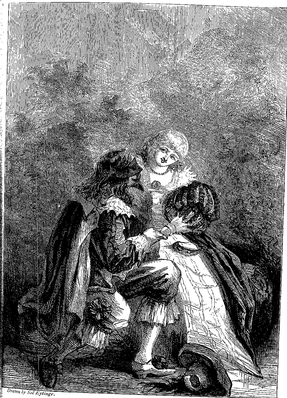
KING CHARLES AND THE MARQUISE.—

A sharp step rang through the ante-room dividing the conservatory from the other apartments, and Francia, snatching away her hand, hurriedly replaced