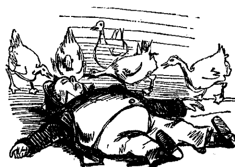
NEW ENGLAND RUM, AND ITS EFFECTS. [See Page 214.]