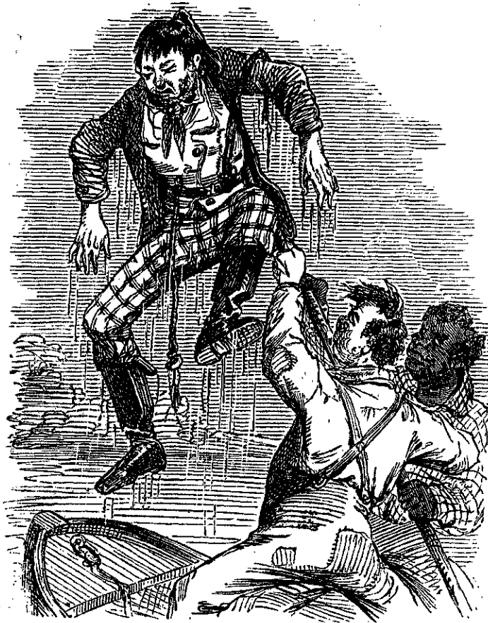
ARTEMUS RESCOOD FROM THE KANAWL. [See Page 128.]

Cyrus Field's Fort is to lay a sub-machine tellegraf under the boundin billers of the Oshun, and then hev it Bust.