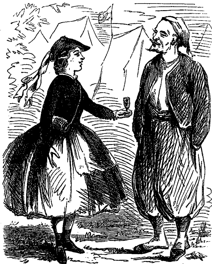
PICCOLOMINI IN THE "CHILD OF THE REGIMENT." [See Page 130.]

tricitities, while the fact is I was stuck. This between you and I.)