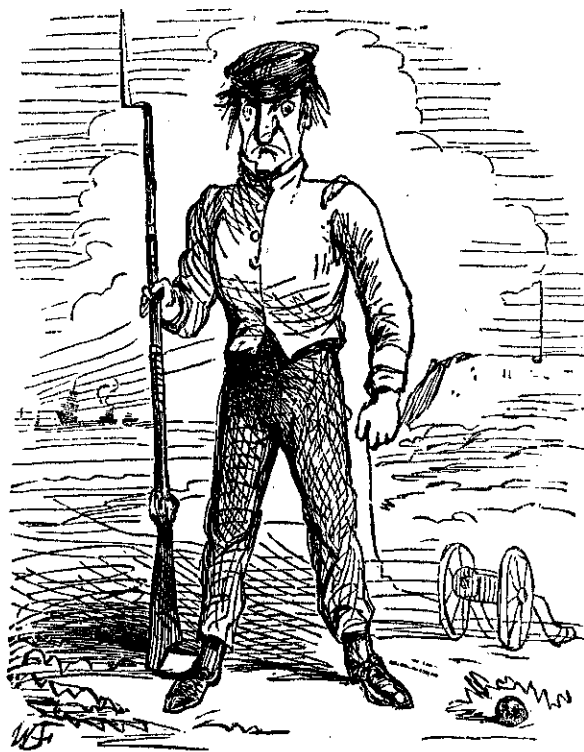
JOE STACKPOLE SAYS HE CAN LICK THE SECESHERS IN A FAIR STAND-UP FIGHT. [See Page 218.]