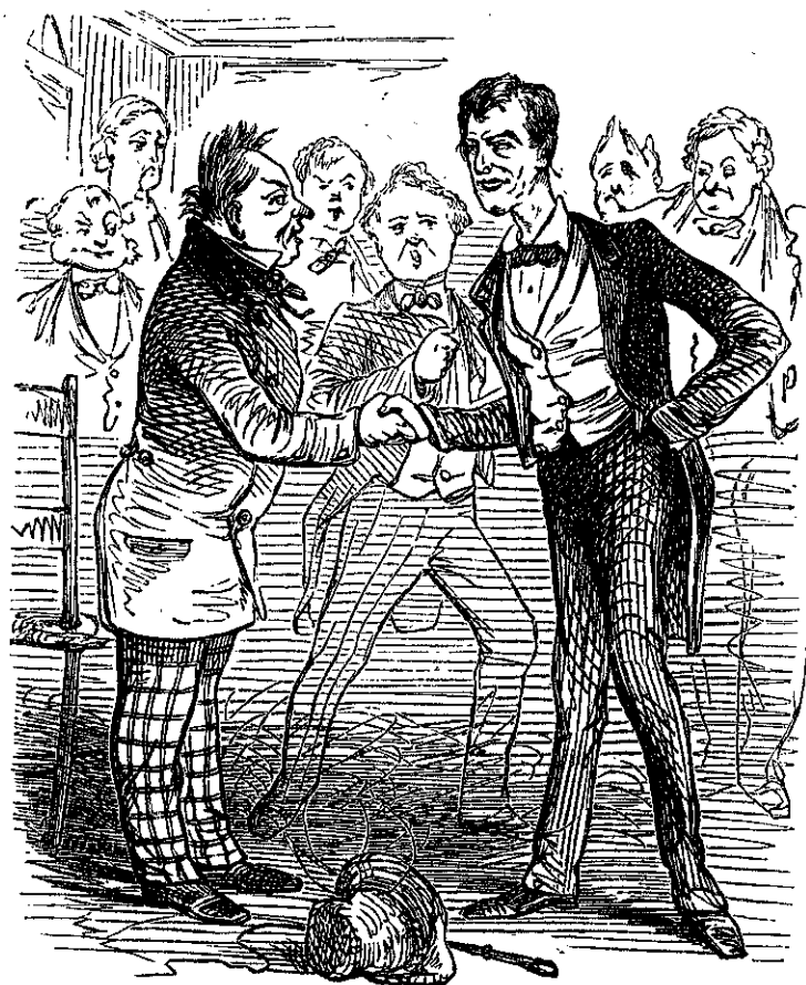
AN INTERVIEW WITH PRESIDENT LINCOLN. [See Page 186.]

I'm not in the bisniss. I'm in a far more respectful bisniss nor what pollertics is. I wouldn't giv two cents to be a Congressser. The wuss insult I ever received was when sertin citizens of Baldinsville axed me to run fur the Legislatater. Sez I, My frends, dostest think I'd stoop to that there?" They turned as white as a sheet. I spoke in my most orfullest tones, & they knowd I wasn't to be trifled with. They slunked out of site to onct.