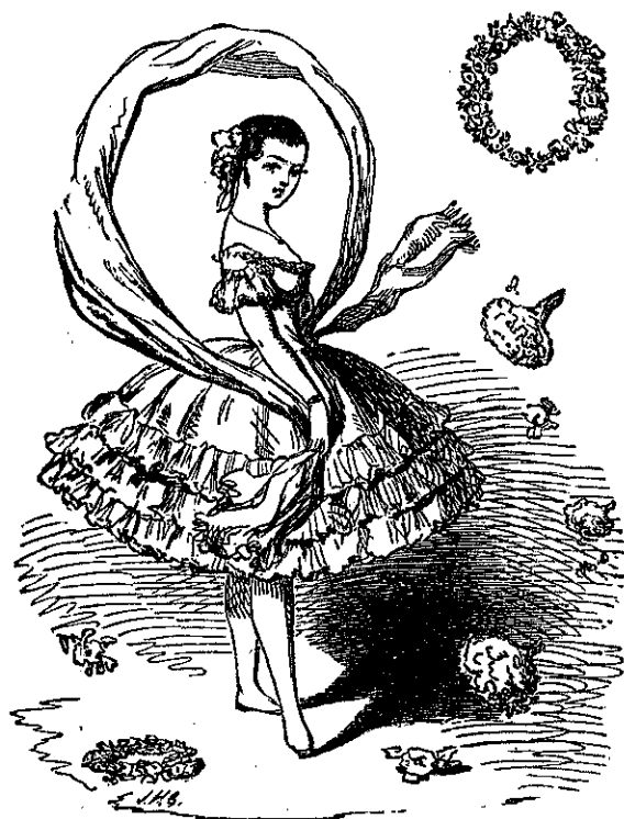
ONE OF THE BROADWAY "SEVEN SISTERS." [See Page 242.]

out eminently theatrical manner, is brought into the cellar. He discovers the ring upon the servant girl's finger — servant girl states that she is innocent, and the dupe, with the remark that he sees his mother, dies, this time positively without reserve. Servant girl is taken to Newgate, whither goes the robber and gains admission by informing the turnkey that he is her uncle. Throws off his disguise, and like a robber bold and gay, says he is the guilty party and will save the servant girl. He drinks a vial of poison, says he sees his mother, and dies to slow fiddling. Servant girl throws herself upon him wildly, and the virtuous young party in a short-tailed coat comes in and assists in the tableau. Robber tells the servant girl to take the party in the short-tailed coat and be happy — repeats that he sees his mother (they always do). and dies again. Cries of "Hi! hi! hi!" and the weeded gentleman reiterates the price of green smelts.