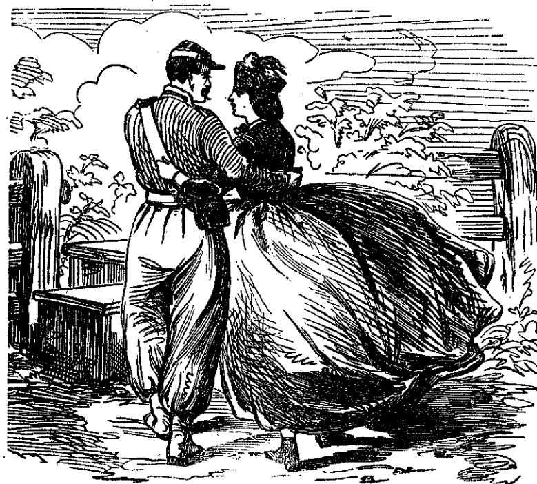
"HOME GUARD DRILL." [See Page 241.]