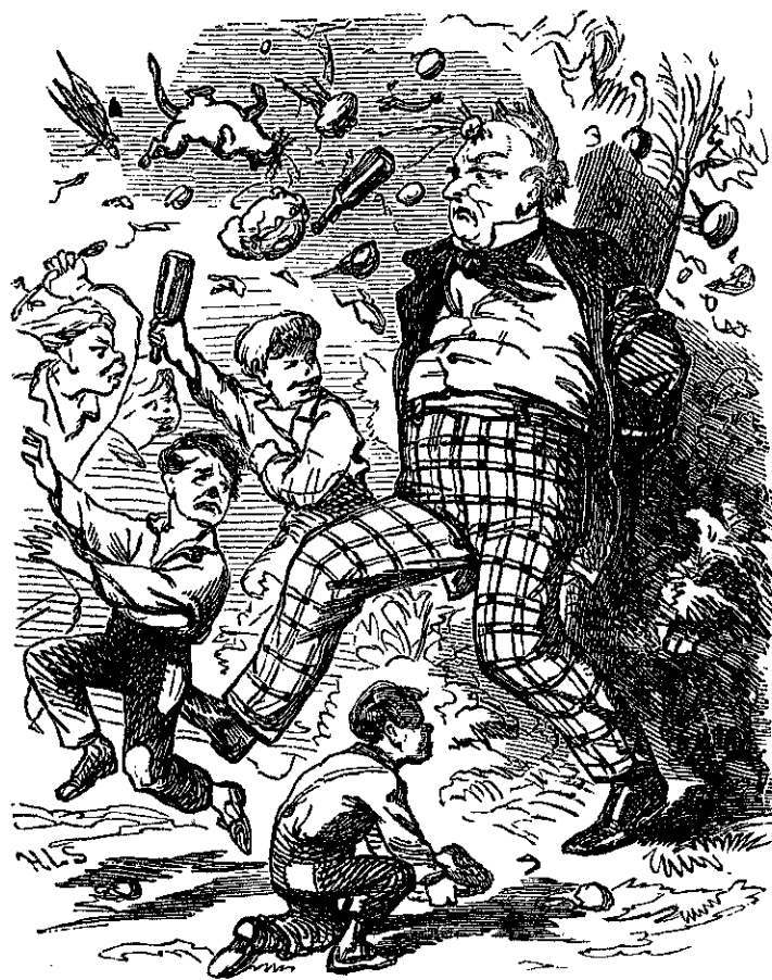
"I WAS CEASED AND TIED TO A STUMP." [See Page 193.]