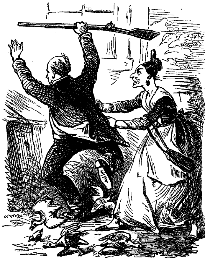
"TWINS, MARM," SEZ I, "TWINS!" [See Page 165]