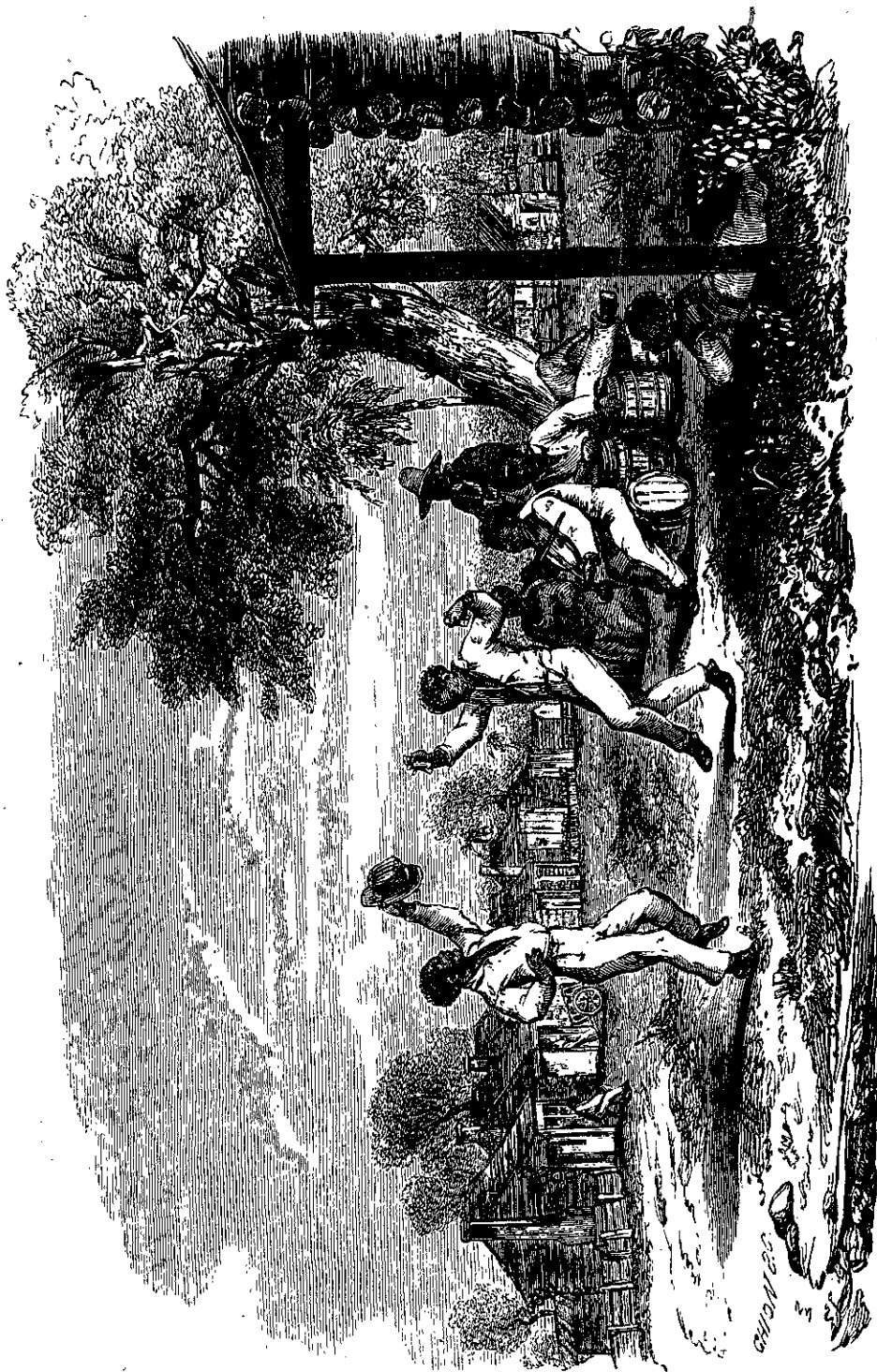
NEGRO VILLAGE ON A SOUTHERN PLANTATION.