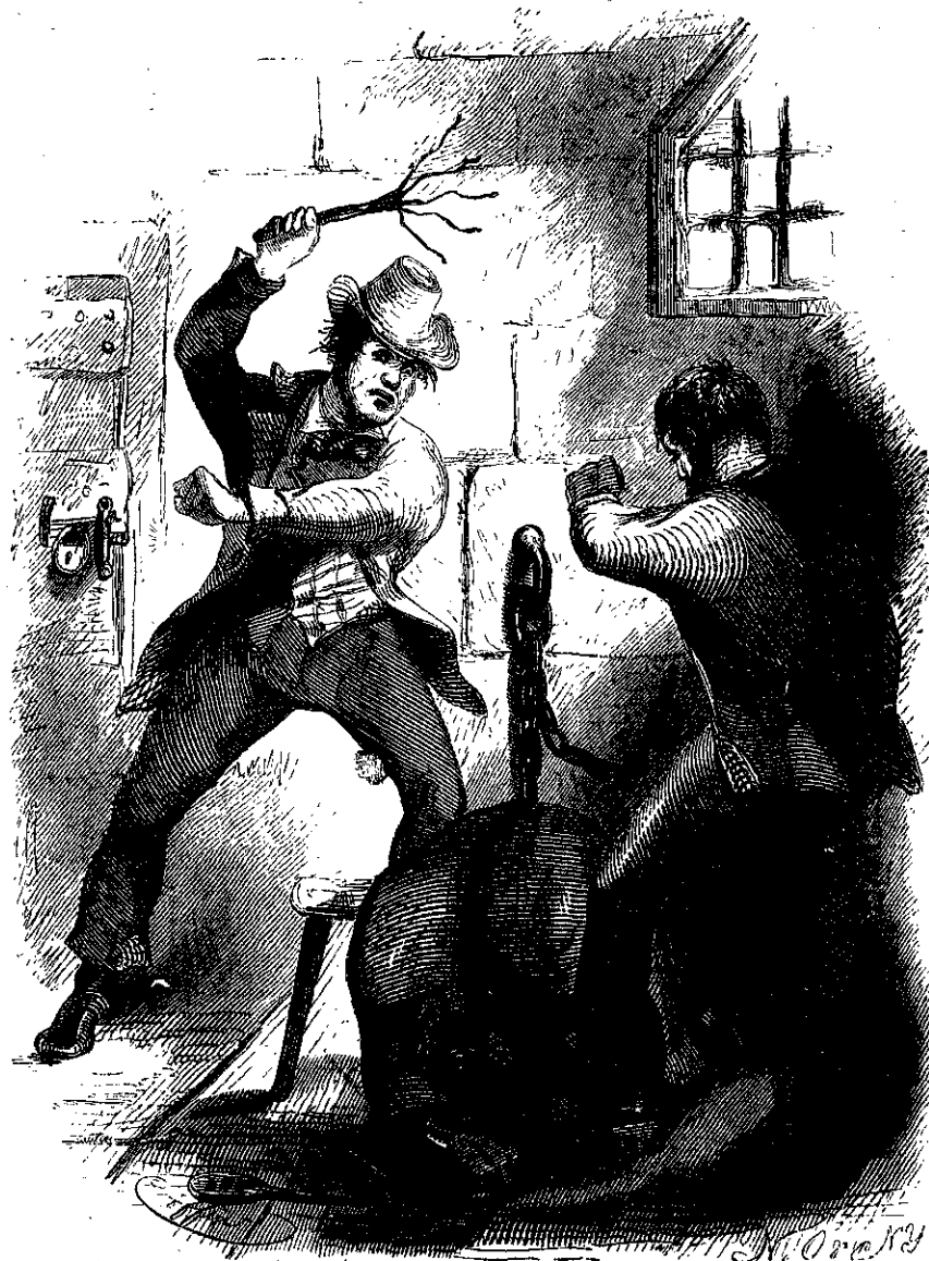
SCENE IN THE SLAVE PEN AT WASHINGTON.

stopped and asked if I still insisted I was a free man. I did insist upon it, and then the blows were renewed, faster and more energetically, if possible, than before. When again tired, he would repeat the same question, and receiving the same answer, continue his cruel labor. All this time, the incarnate devil was uttering most fiendish oaths. At length the paddle broke, leaving the useless handle in his hand. Still I would not yield. All his brutal blows could not force from my lips the foul lie that I was a slave. Casting madly on the floor the handle of the broken paddle, he seized the rope. This was far more painful than the other. I struggled with all my power, but it was in vain. I prayed for mercy, but my prayer was only answered with imprecations and with stripes. I thought I must die beneath the lashes of the accursed brute. Even now the flesh crawls upon my bones, as I recall the scene. I was all on fire. My sufferings I can compare to nothing else than the burning agonies of hell!