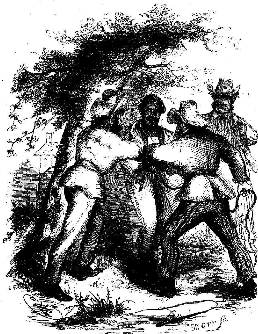
CHAPIN RESCUES SOLOMON FROM HANGING.

looking from the window. Hope died within my heart. Surely my time had come. I should never behold the light of another day — never behold the faces of my children — the sweet anticipation I had cherished with such fondness. I should that hour struggle through the fearful agonies of death! None would mourn for me — none revenge me. Soon my form would be mouldering in that distant soil, or, perhaps, be cast to the slimy reptiles that filled the stagnant waters of the bayou! Tears flowed down my cheeks, but they only afforded a subject of insulting comment for my executioners.