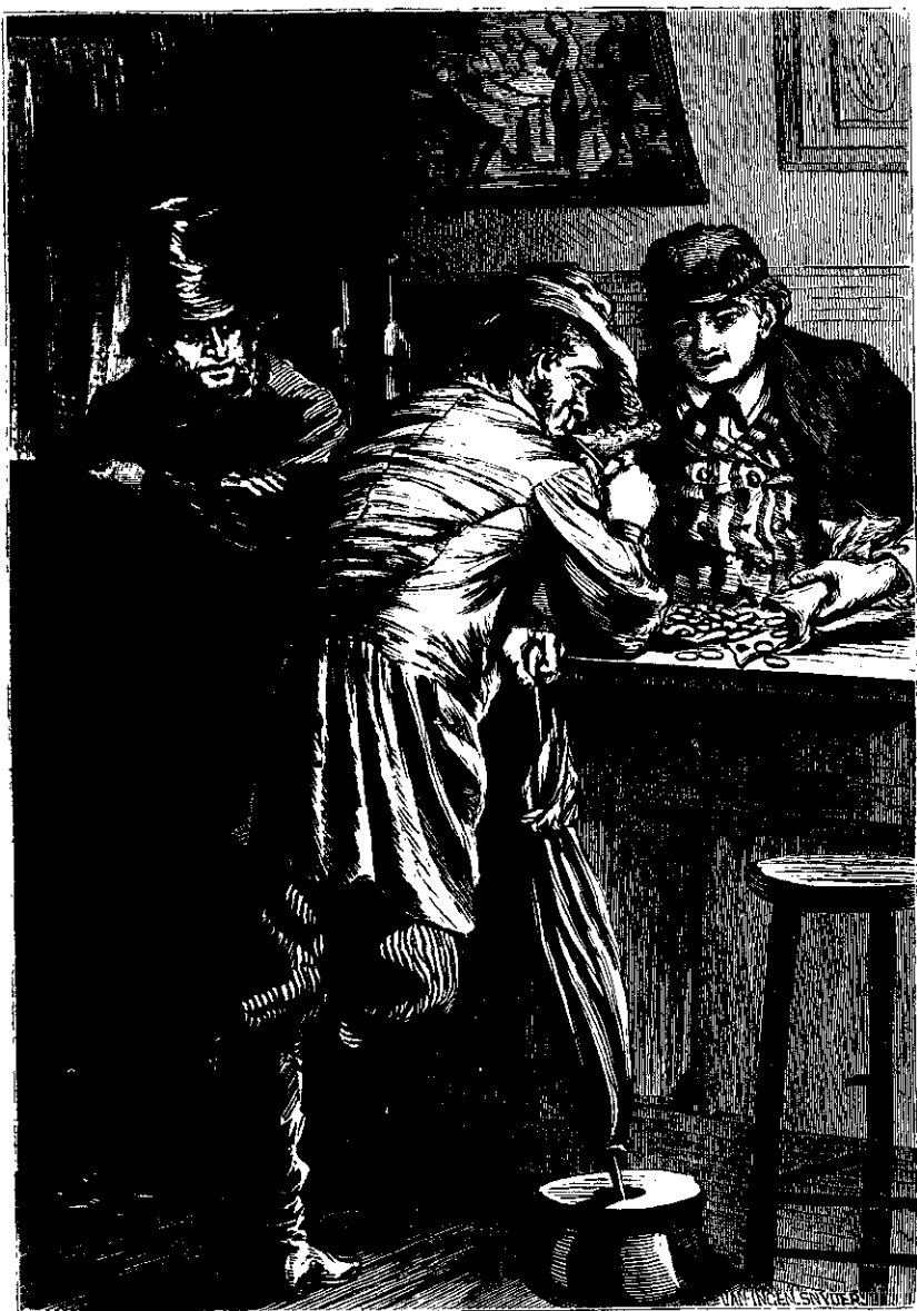
THE HEEDLESS EXPOSURE.