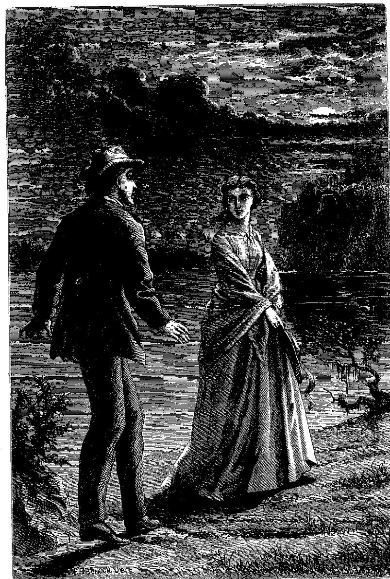
The figure that Ethan saw on the Lake shore.

When Ethan Hartland left Rosebank that evening he could not make up his mind to return directly home. A full moon shone down brilliantly from a cloudless sky. His heart needed the quieting influence. It was full of gratitude, and not without hope, but it was restless: the hope was dashed with uncertainty.