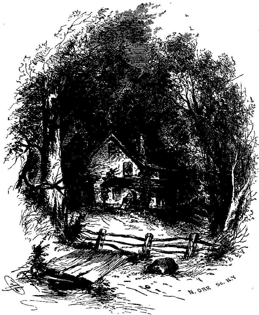
THE LITTLE BROWN HOUSE.