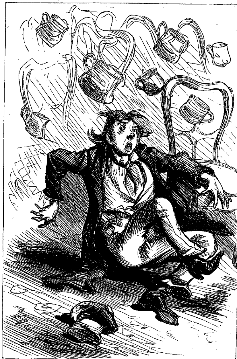
Josh Billings is satisfied that lager beer as a drink is not intoxicating; but having indulged rather freely one day, he finds it difficult, when he sits down, "to catch the chair as it comes round."—See page 169.

and in setting down onto a chair, i didn't wait quite long enuff for it tew git exactly under me, when it was going round, and i sett down a little too soon, and missed the chair by about 12 inches, and couldn't git 'up quick enuff tew take the nex one when it cum, and that ain't aul; mi wife said i was az drunk az a beast, and az i sed before, i begun tew spit up things freely.