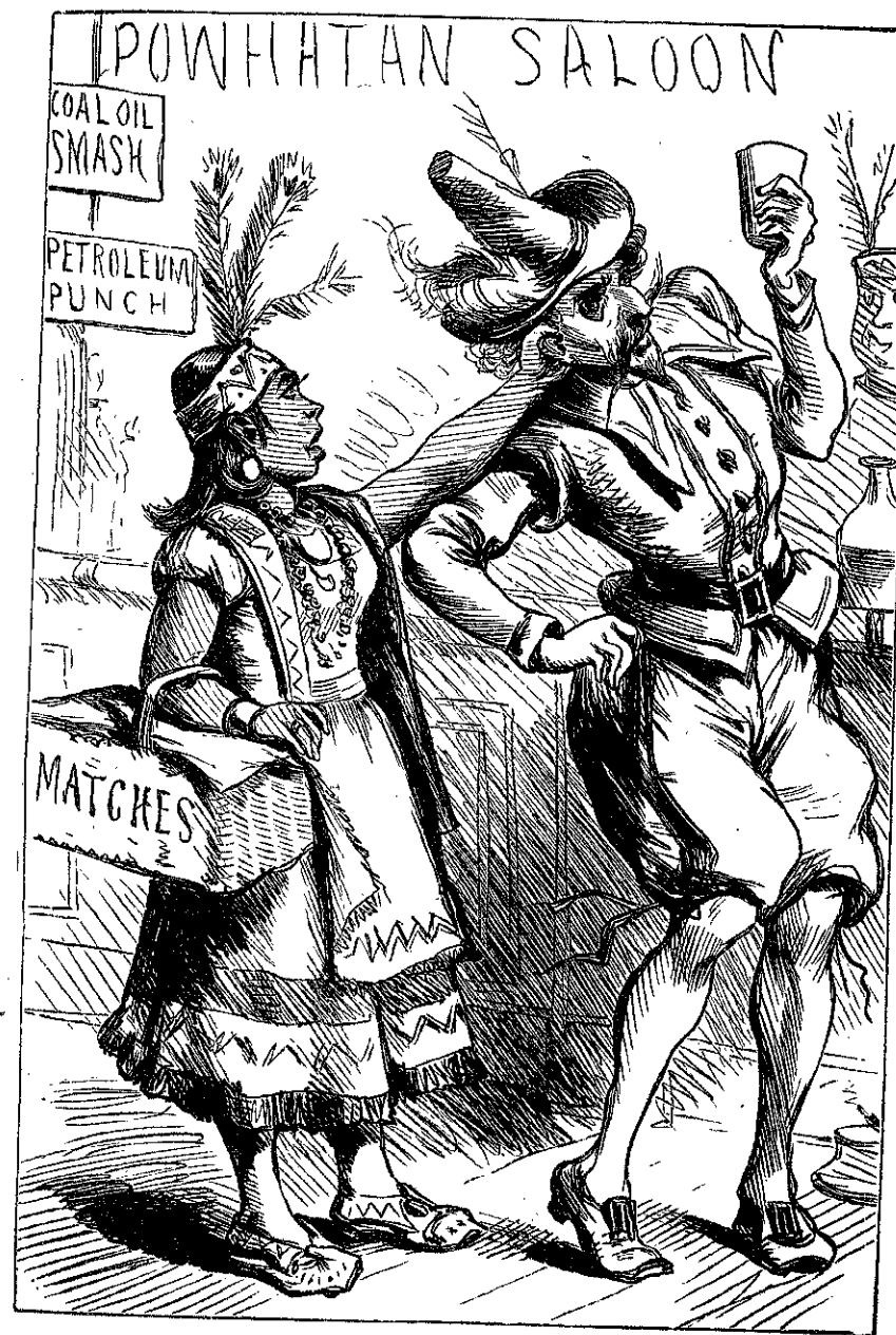
The artist takes a poetic license with Mr. Billings' Story of Pocahontas, and represents John Smith getting "slew'd" in a modern bar-room.—See page 134.

Yu ought teu read history, Ezra; it will learn yu informashun, and give you a knolledge ov eduka-shun.