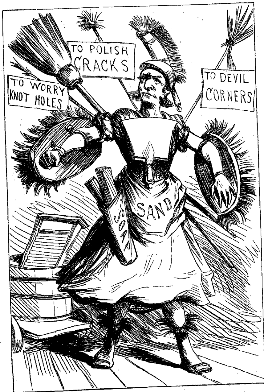
The artist here represents NEATNESS [when carried too far] as a Roman Warrior, armed with every symbol of house-cleaning apparatus, and waging war upon all un-offending people who are not willing to have their apartments thoroughly cleaned every day.—See page 193.