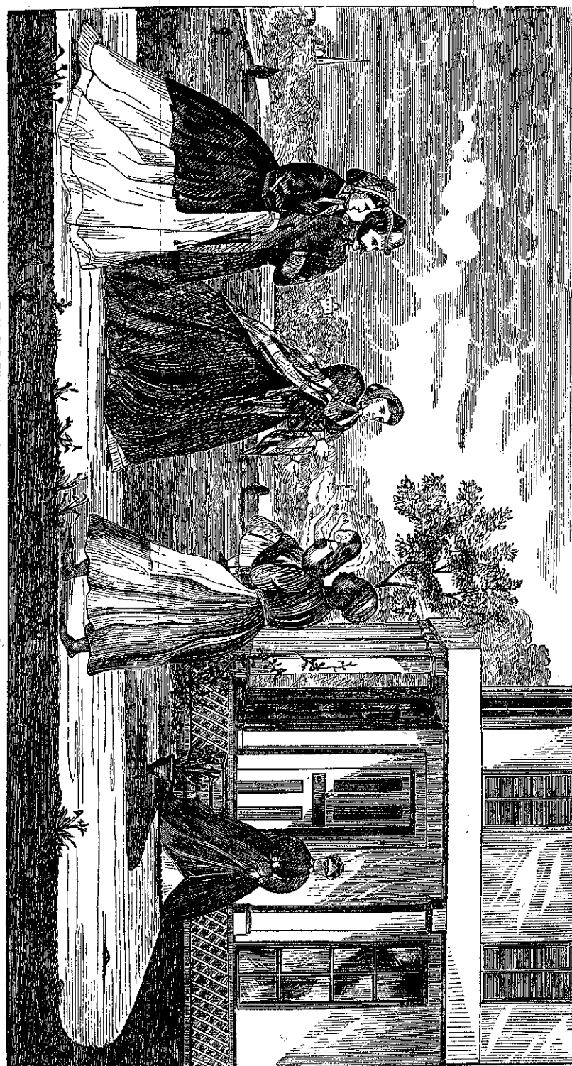
RECOVERY OF THE LONG LOST CHILD.

"O, bless the Lord for this day! I kep' her for you, Miss 'Genia, tho' I thought you was dead, may-be; but I know'd you'd come if you wasn't. Old missis said you'd never come back any more, and that made me take better care of Miss Lily, for I thought if you was an angel, it'd please you to see me; but if you wasn't you'd come to her. Anyway she needed me, and she's the beautifulest child that ever was!"