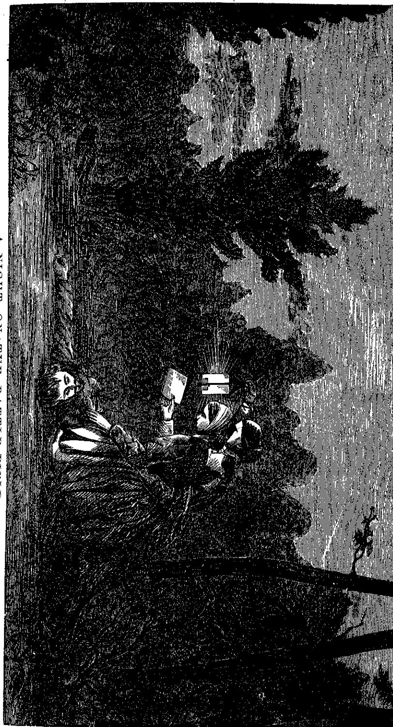
A NIGHT ON THE BATTLE-FIELD.

"Aha! it makes you tremble, does it? You see I know too much for you to take a high hand with me. I promised you payment at Paducah, and I've given you a taste of it already. What got Captain Wilfer into trouble, and who caused him to be dismissed the service for meeting flags of