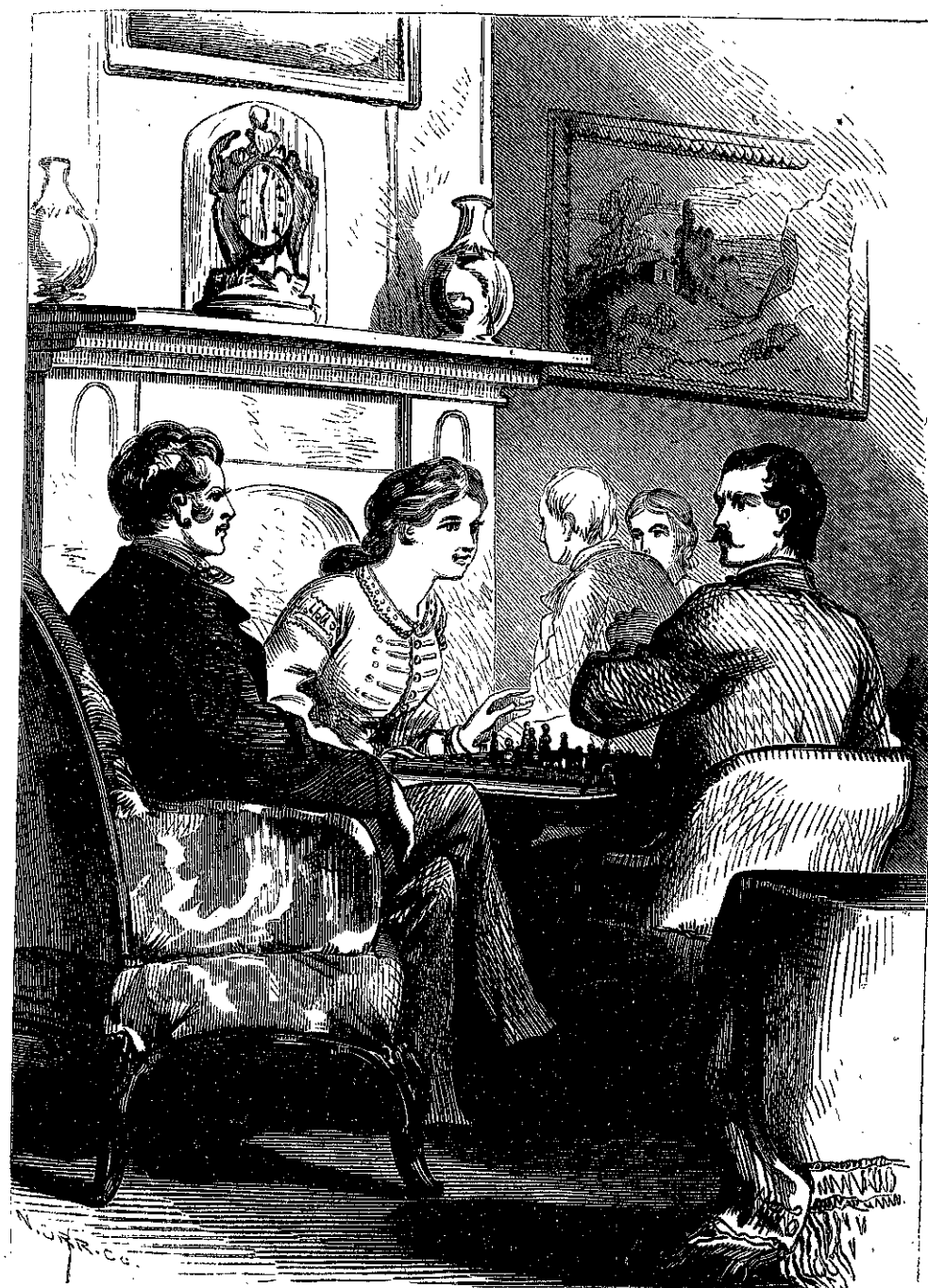
"WELL, HOW DO YOU LIKE MY LOOKS, RICHARD?"

I was interested in watching two things—first, the attachment between Miss Argyll and Lenore; secondly, the persistent effort of James to overcome his first