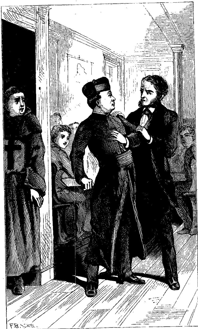
“Leave the room, sir, or I must call a policeman!” Almost a Priest.